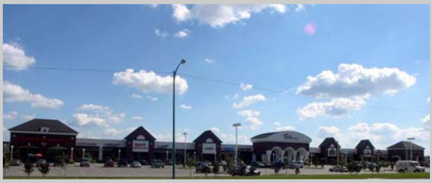
Battlefield Market Place Phase I